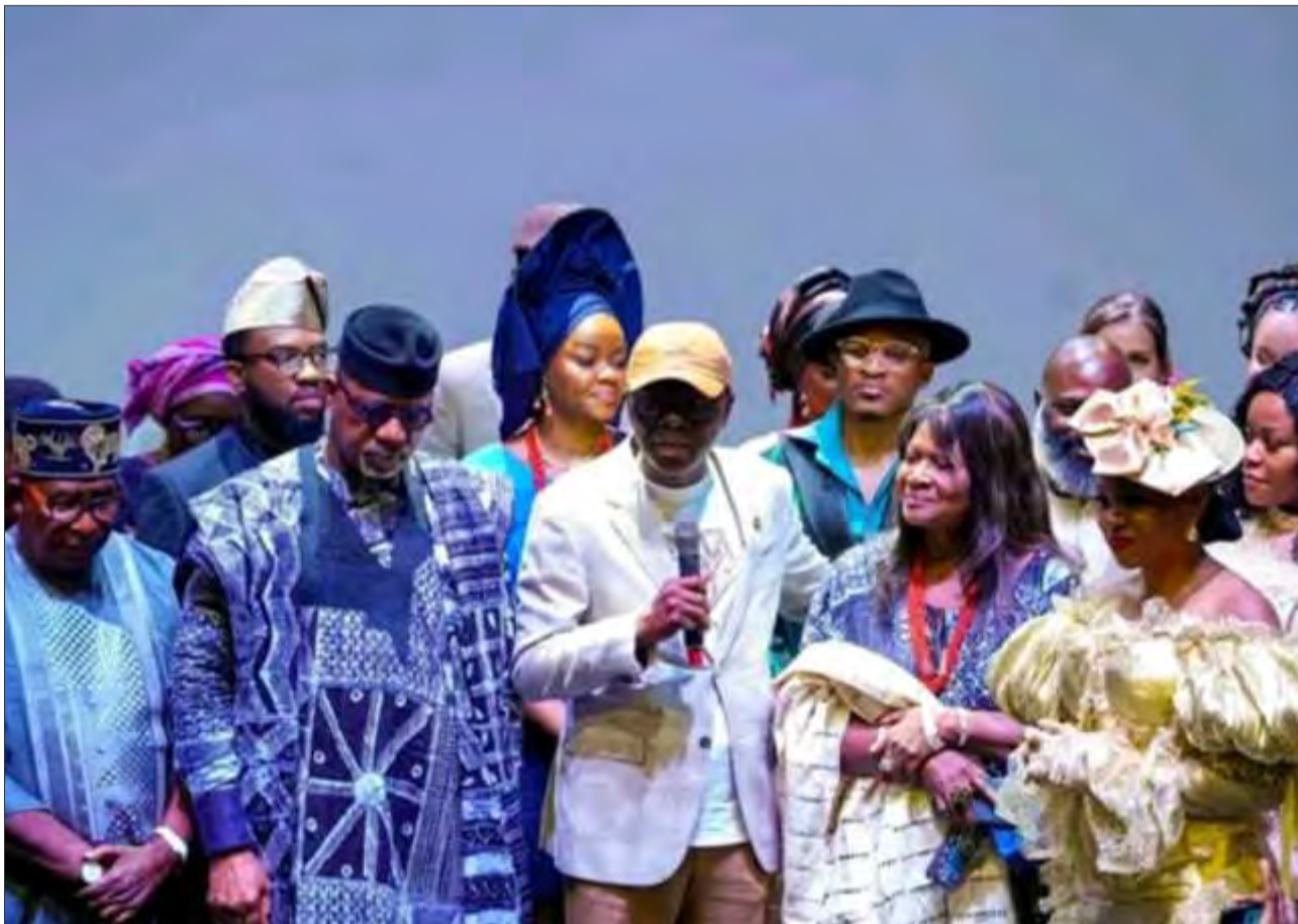
Governor Babajide Sanwo-Olu, his counterpart for Ogun, Dapo Abiodun with actors and actresses at the premiere of Funmilayo

She said that the administration of Governor Sanwo-Olu gave N400 million to filmmakers as grants and has also