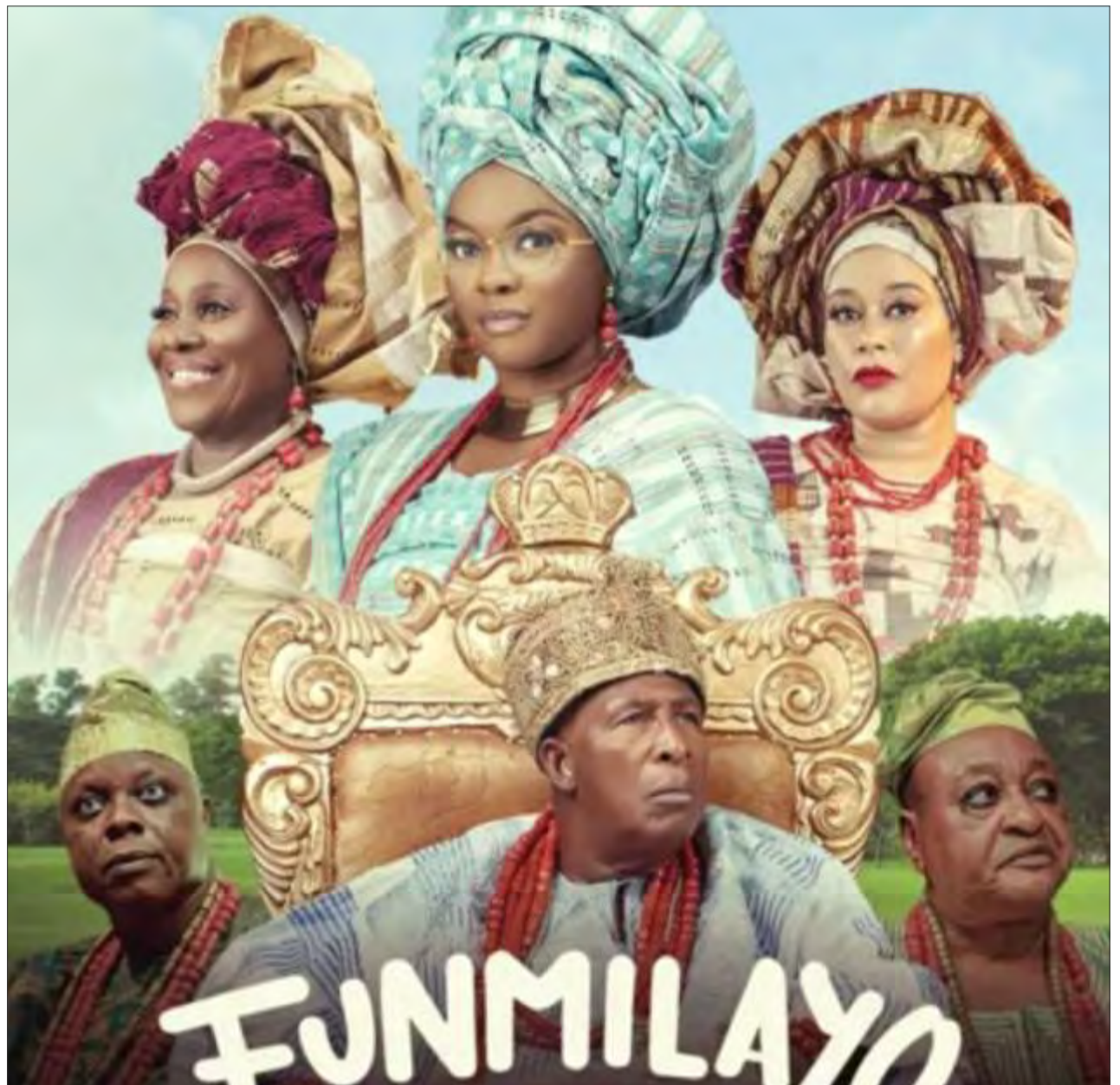
Casts of Funmilayo Ransom Kuti

The ambitious project is expected to be a thriving hub for various aspects of the film industry, encompassing film